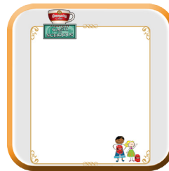
Flyer Template (MS Word)